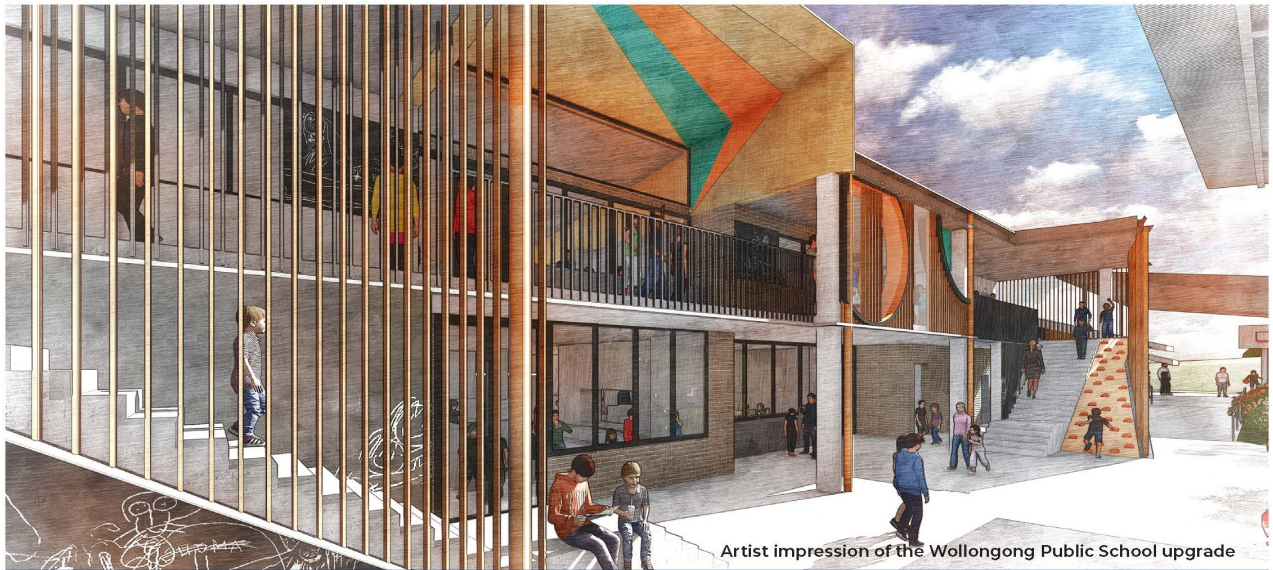
Artist impression of the Wollongong Public School upgrade