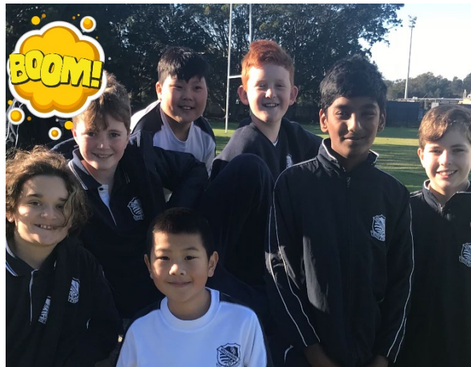
Stage 3 Boys Dragon Tag