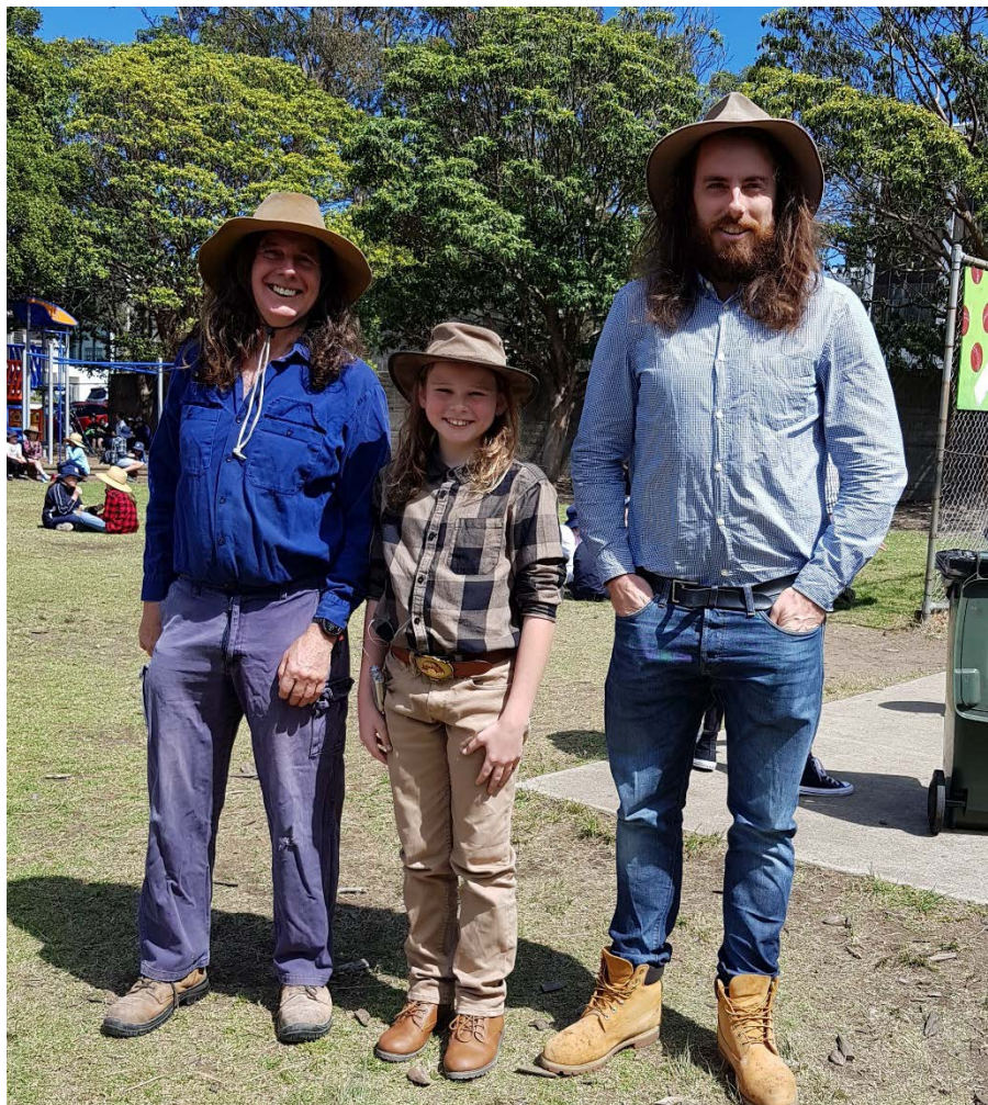
"Three farmers who dropped in for the day"