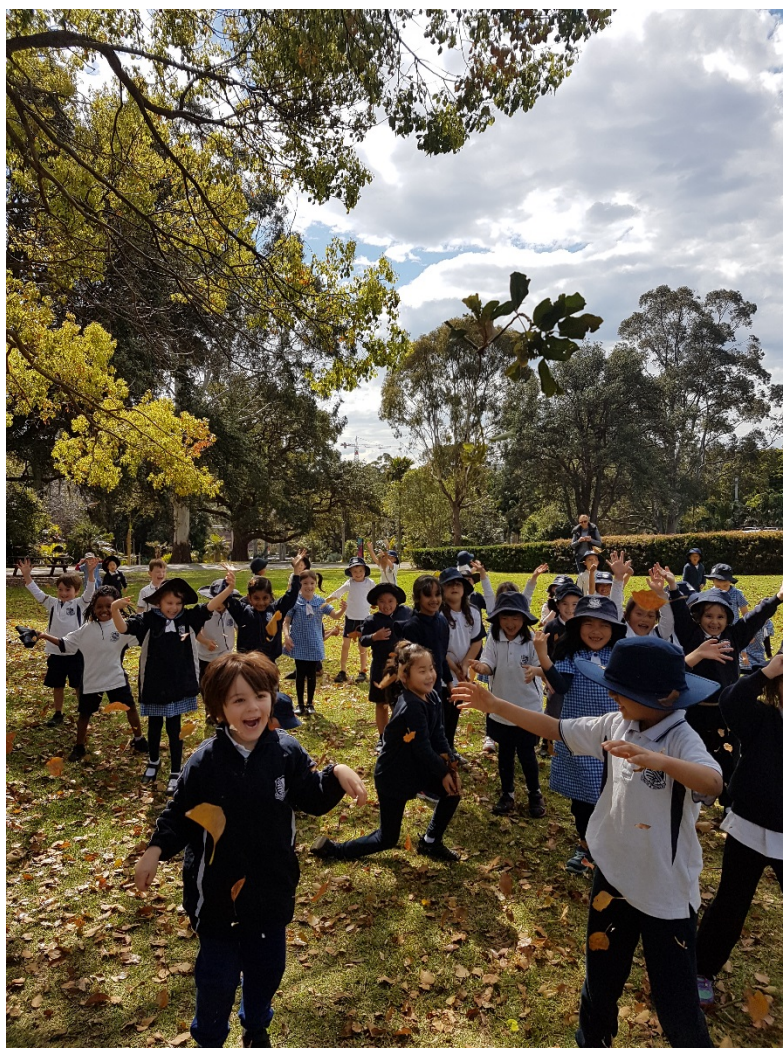
Early Stage One at the Botanic Gardens